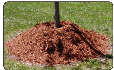
Do not create a "mulch volcano"; keep the trunk free of contact with mulch. Spread the material out, don't mound it up.