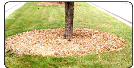
Properly mulched tree; mulch applied 3-4" deep, spread out under the tree with no plastic or fabric liner underneath