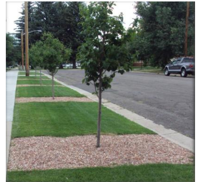
Examples of wood chip, bark, and pebble/stone yard mulch.

Unwanted weeds will eventually seed into mulch beds regardless of the materials used. It is important to pull newly emerging weeds or use herbicide treatments to maintain your mulched areas. Using wet newspaper or cardboard under your mulch is an effective way to smother weeds in your mulched beds if you prefer not to use herbicides. Weed control is important to ensure your tree does not have to compete for nutrients.