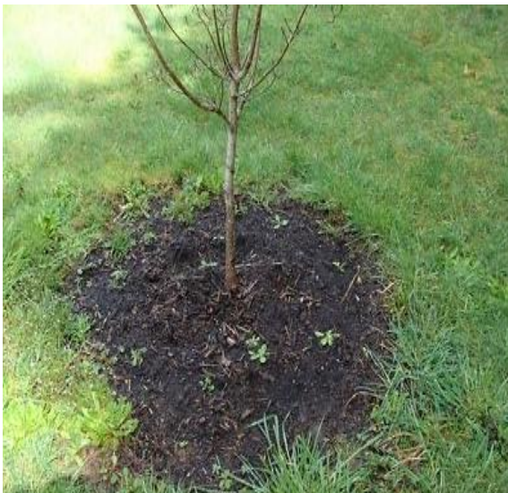
Weeds overgrowth in mulched area.

Unwanted weeds will eventually seed into mulch beds regardless of the materials used. It is important to pull newly emerging weeds or use herbicide treatments to maintain your mulched areas. Using wet newspaper or cardboard under your mulch is an effective way to smother weeds in your mulched beds if you prefer not to use herbicides. Weed control is important to ensure your tree does not have to compete for nutrients.