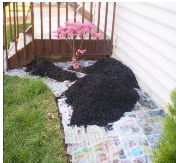
Using wet newspaper to suppress weed growth.