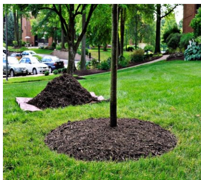
Proper mulch ring around young tree